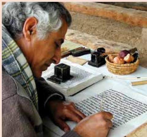
Jewish scribe copies Holy Scripture in Hebrew

All we know about the living God comes to us through the Jewish people and yet for centuries they have been persecuted in Britain as in other lands. The horrors of expulsion from one English town