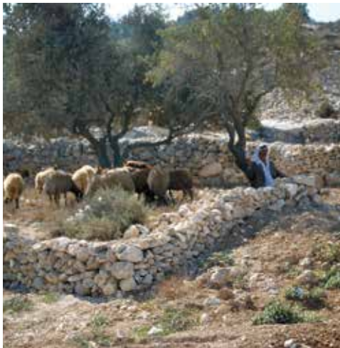
Arab Shepherd with his flock near Bethlehem

Historically the descendants of Ishmael and Isaac have lived together peacefully, albeit in different parts of the region, and it is only in recent times that serious enmity has arisen. Islam took hold among the Arab people in the 7 th Century and its extremes have become a force of hatred against the Jews.