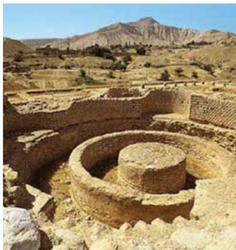
Excavations in Jericho

A Gentile enemy of the Jews is found early in the Bible during Israel's exile to part of King Xerxes' vast empire. A man called Haman,