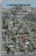
A SHORT HISTORY OF THE HOLY LAND Chris Mottershead

After reading this leaflet, you may be interested to use our website, where there are teaching articles on these subjects and more, plus details of resources and podcasts available. Recommended resources: