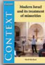
ISRAEL'S TREATMENT OF MINORITIES Shadi Khaloul