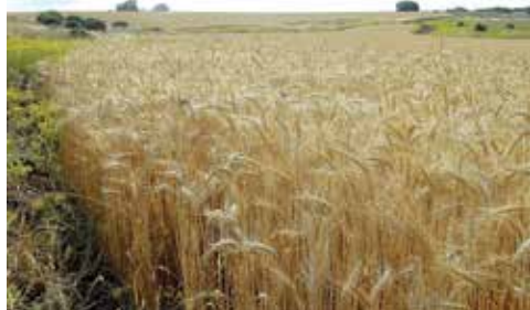
Wheat field near Bet Guvrin kibbutz

The second return got going around 1881, and was strongly supported by many leading Christians in Britain, including Spurgeon and